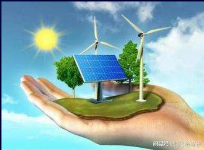
Green Productivity 绿色生产力