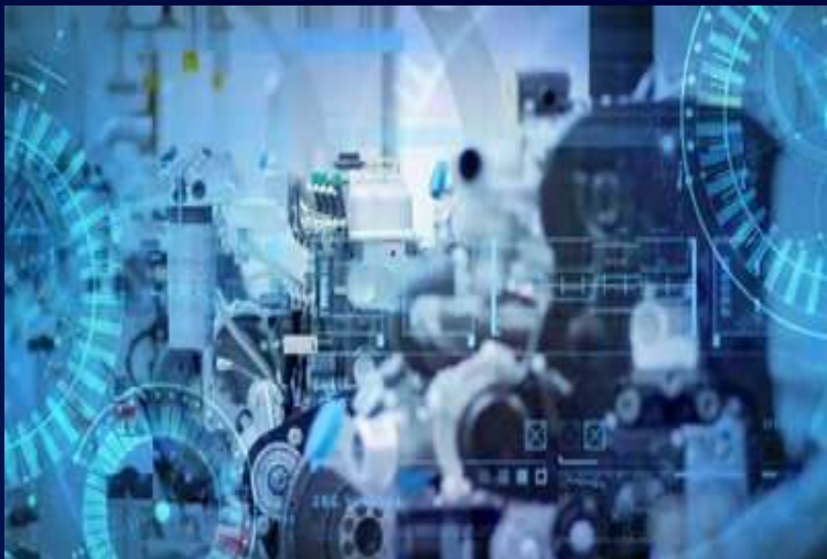
Digital Productivity 数字生产力