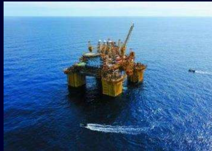
Blue Productivity 蓝色生产力